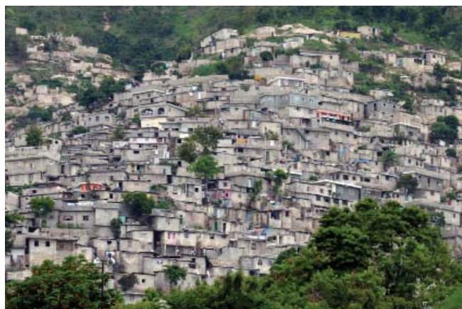
The hills over Port-au-Prince before the earthquake